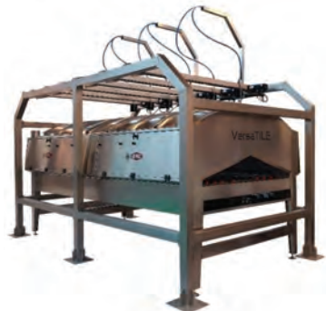
Versatile Plus System for tiles glazing