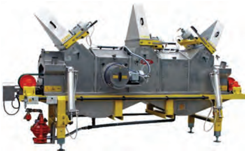
Multiglaze / 5 System for roof tiles glazing

Officine Smac S.p.A. was founded in 1969 and is strategically located in the heart of the Italian ceramic district, in Fiorano Modenese. With its name and logo, a scorpion that grabs brushes, Officine Smac stands out in the world as a manufacturer of automations, glazing lines and machineries for ceramic tiles, roof tiles and bricks industries. First and only Italian company in patenting specific cooling system for inkjet printed ceramic tiles. Thanks to an intensive research activity and targeted strategic choices, Officine Smac has been able to expand on all international markets becoming one of the leading companies in the glazing machineries industry and point of reference for the customers. The company boasts qualified technical staff able to offer specific projecting skills and post sales assistance in all the countries. The international specialized commercial network identifies and satisfies customer needs.