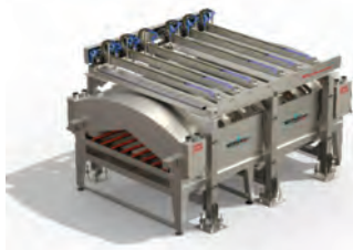
Veloce 6 (Airless System with 6 independent Axis)