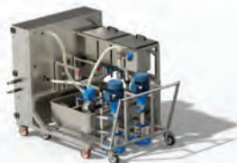
Glaze Station (Density and viscosity checking for glaze preparation machine)